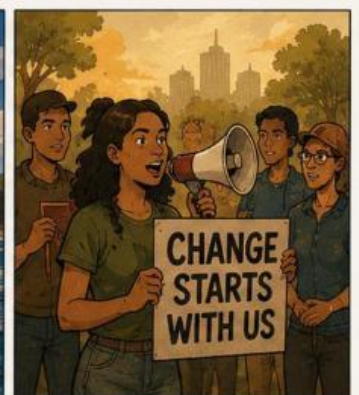
• make change