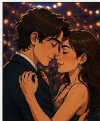
• cheek to cheek