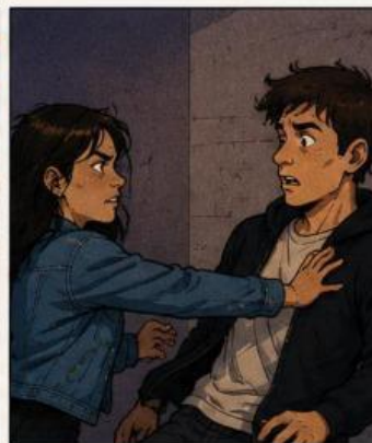
• push away