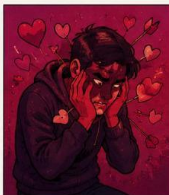
• punch drunk love