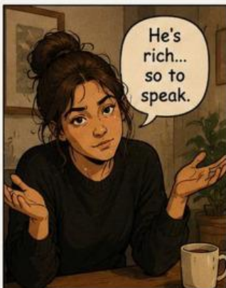
• so to speak