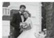
1 get married

be born die go to school finish university get married go to university grow up have a baby stop working