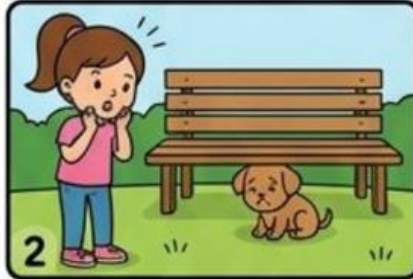
2 Mia sees a lost puppy.