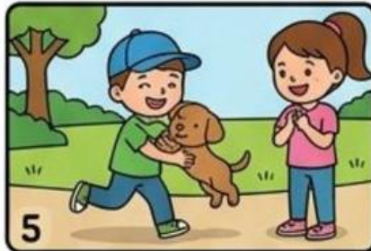
5 A boy hugs the puppy.