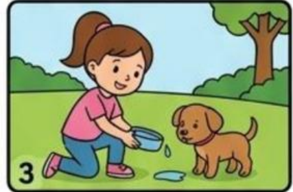
3 Mia gives water to the puppy.