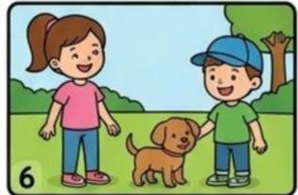
6 The puppy is safe.