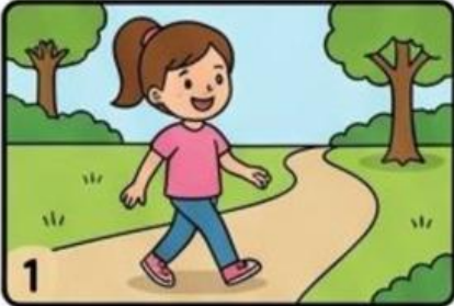
1 Mia walks in the park.