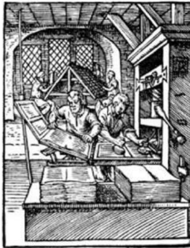
Gutenberg-style printing press. Left: removing a page. Right: inking the type. Back: setting the type.