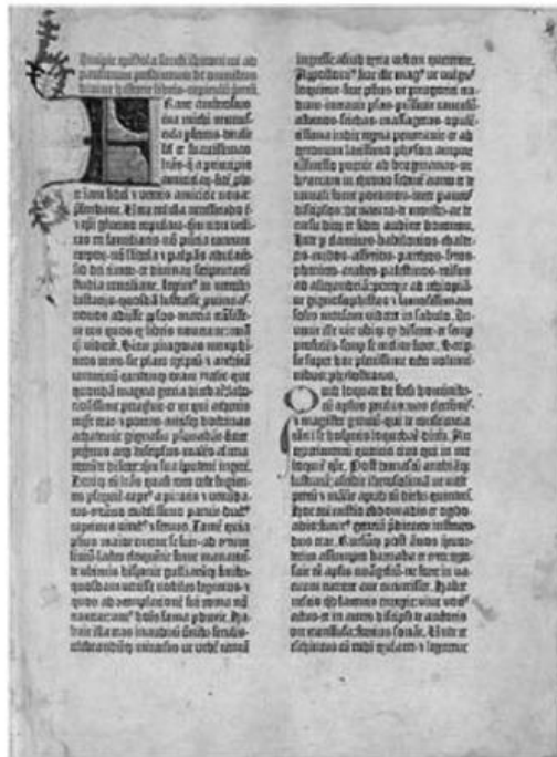
The first page of the Gutenberg Bible