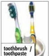
toothbrush / toothpaste