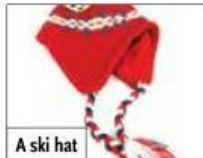
A ski hat