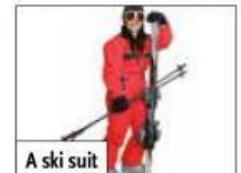
A ski suit