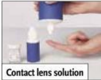
Contact lens solution