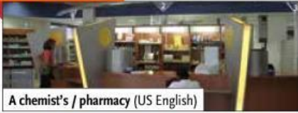
A chemist's / pharmacy (US English)