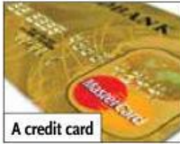
A credit card