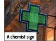
A chemist sign