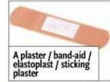
A plaster / band-aid / elastoplast / sticking plaster