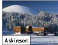
A ski resort