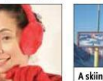
A skiing instructor