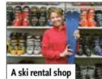
A ski rental shop