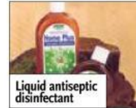
Liquid antiseptic disinfectant