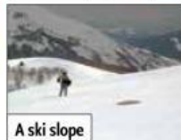
A ski slope