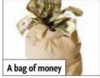
A bag of money