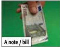
A note / bill