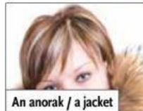
An anorak / a jacket