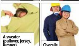
A sweater (pullover, jersey, jumper)