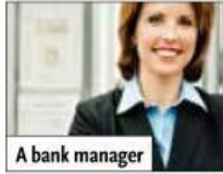
A bank manager