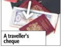
A traveller's cheque