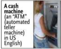
A cash machine (an "ATM" (automated teller machine) in US English)