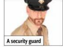
A security guard