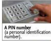
A PIN number (a personal identification number).