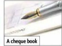
A cheque book