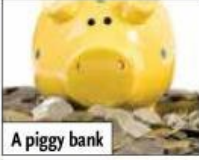
A piggy bank