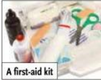
A first-aid kit