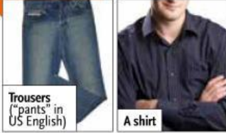
Trousers ("pants" in US English)