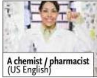
A chemist / pharmacist (US English)