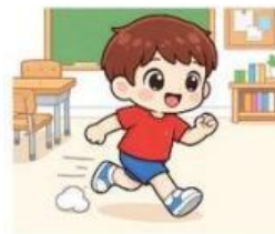
running in class