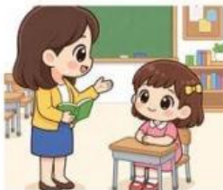
listening to the teacher