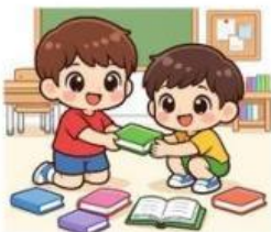
helping a friend