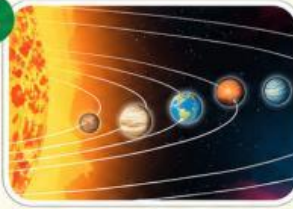
The orbit of the planets around the sun