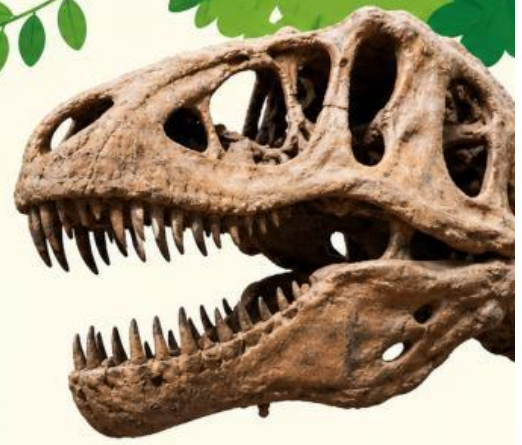
C The Titanosaur