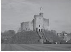
A - Cardiff Castle