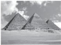
C - Pyramids of Egypt

My name's Sara and I'm from Spain. I live in Barcelona. My city is famous for its food, culture and buildings. One of the top tourist attractions is a church, the Sagrada Familia. It is the symbol of my city. But it's not finished yet, over 100 years after they started building it! Quiet days here are few and far between. There are always a lot of tourists, particularly on Saturdays and Sundays, so I never go there at the weekend.