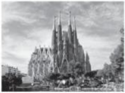
B - The Sagrada Familia