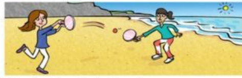
5 Saturdays / go to the beach