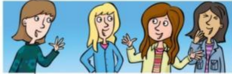
3 Thursdays / meet her friends