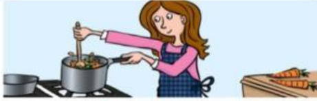
2 Wednesdays / make dinner