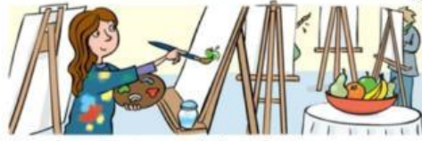
1 Tuesdays / go to a painting class