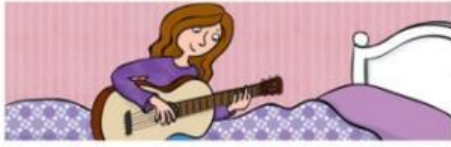
▶ Mondays / play the guitar On Mondays, she doesn't play the guitar.