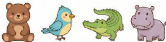
Bear bird crocodile hippo