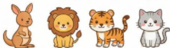
kangaroo lion tiger cat