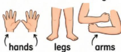
hands legs arms