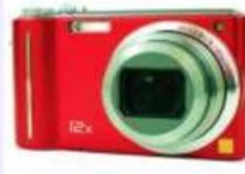
máy ảnh kỹ thuật số