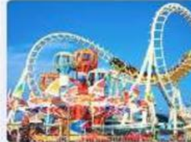
Công viên giải trí