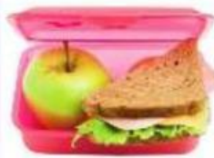
hộp cơm trưa