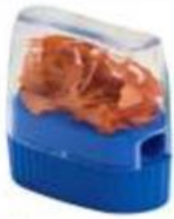
cái gọt bút chì