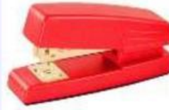
cái bấm ghim