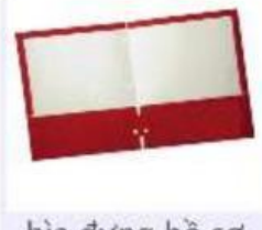
bìa đựng hồ sơ