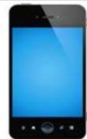
điện thoại di động