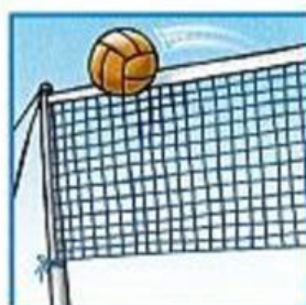
a volleyball net