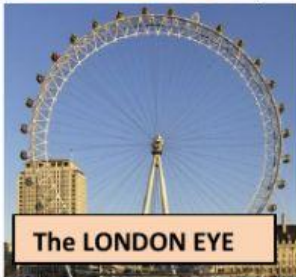
The LONDON EYE