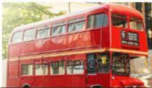
The DOUBLE DECKER