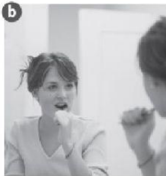
brushing her teeth