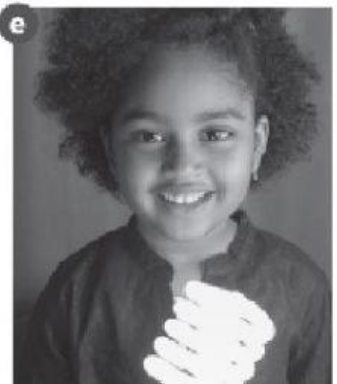
using low energy bulbs