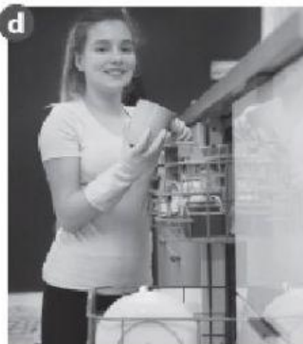
emptying the dishwasher