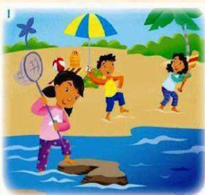
1 It is August. My brother and sister play with a ball and an oar on the beach. I walk in the water with a net.