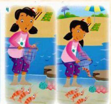
4 Look! This prawn has brothers and sisters. It likes to play in the water, just like me. Goodbye, prawn.