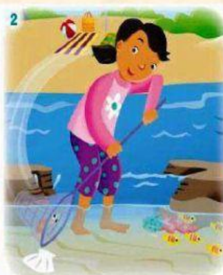
2 The fish are too fast, but the prawn is slow. I catch the prawn in my net!