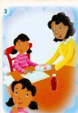
3 My mother can cook the prawn, and I can eat it with sauce and a fork.