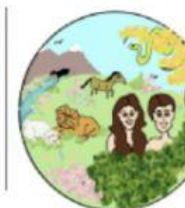
Man & Animals