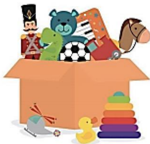
My Toy Box

I have a big toy box in my room. I keep my cars, dolls, and a blue ball inside it. Every Saturday I clean the box. My favorite toy is my small red car. I play with it every day!