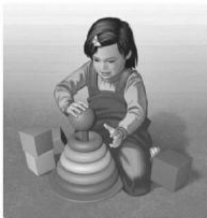
1 She's a _____.

centenarian elderly infant in his / her teens in his / her twenties middle-aged toddler young child