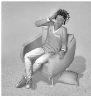
2 He's _____.