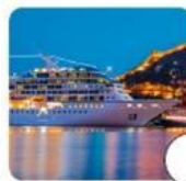
go on a cruise