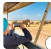
go on a safari

B. Look at the pictures of the three places below. What can you do at each place? Put the words in the box under the correct picture.