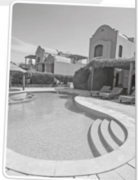
UNIT 5 | DREAM HOUSES 47