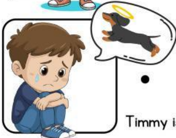
Timmy is sad