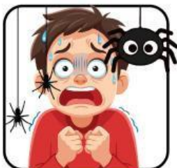
Kevin is scared