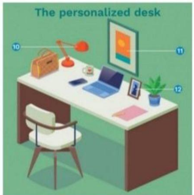
The personalized desk