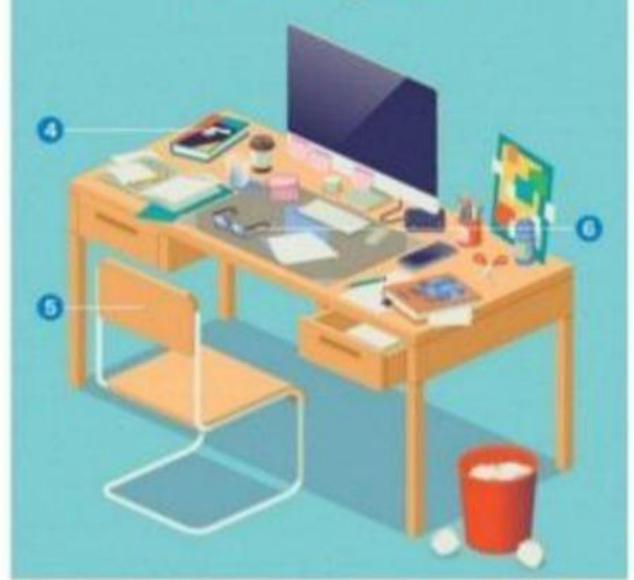
The untidy desk