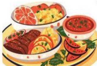
Typical food of Brazil