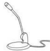
2 m _____