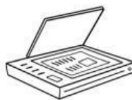
1 s _____