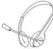
4 h _____ h _____