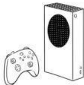
3 g _____ c _____