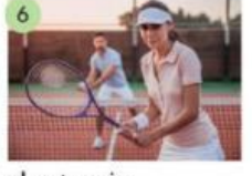
6 play tennis /pleɪ 'tenɪs/