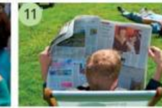
11 relax /rɪ'læks/