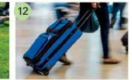
12 travel /'trævl/