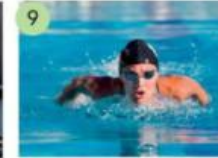
9 swim /swɪm/