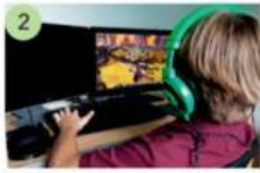
2 play computer games /pleɪ kəm'pyʊtər geɪmz/