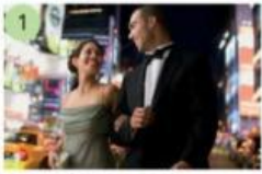
1 go out /ɡoʊ aʊt/ (at night)