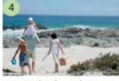
4 go to the beach /ɡoʊ tə ðə bi:tʃ/ (the movies , the theater , etc.)