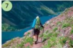
7 hike /haɪk/ (in the mountains )