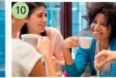
10 meet friends /mi:t frendz/