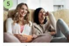
5 stay at home /steɪ ət hoʊm/