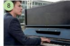
8 play the piano /pleɪ ðə pi'ænəʊ/