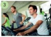
3 exercise /'eksərsaɪz/