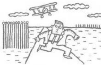
10 a classic film