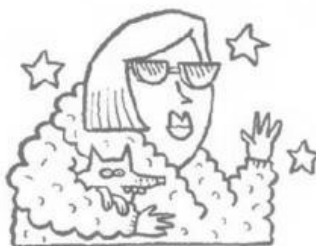
5 a famous actor