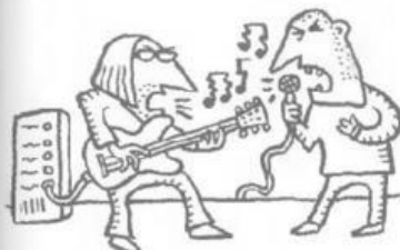
6 a music group