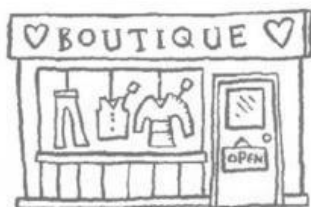
4 a shop