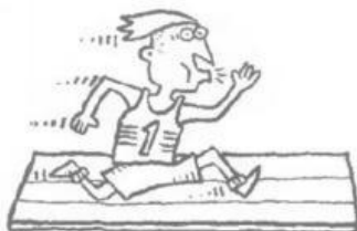
7 a sportsman