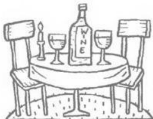
2 a restaurant