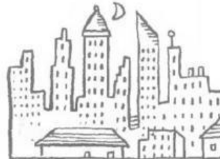
8 a city