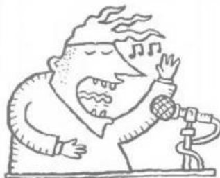
1 a singer