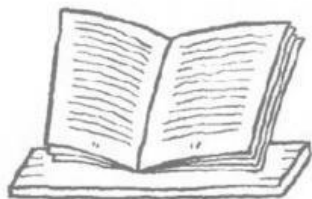
9 a book