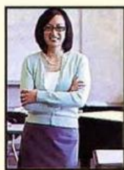
High School Teacher $44,000