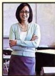
High School Teacher $44,000