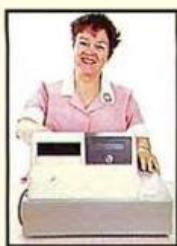
Sales Clerk $20,000