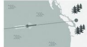
fly straight ahead

Let's play a video game! Look, that's our plane. First, we 1 _____ to the sky. Then it's very easy, we only need to 2 _____ and 3 _____ an island. Now, be careful! We have to 4 _____ some black clouds!