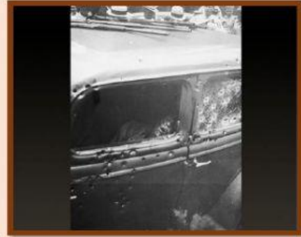
Figure 2. Bonnie and Clyde's car after being murdered