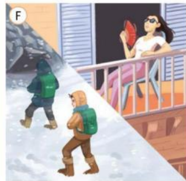
countryside / city