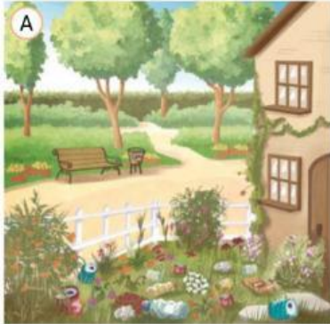
flower garden / park