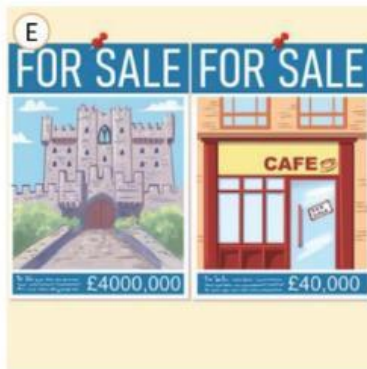
castle / café