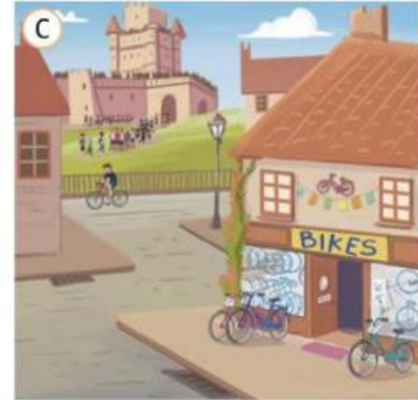
bike shop / castle