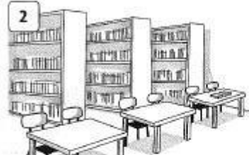
l ib rary