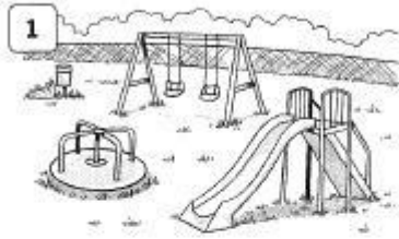
pla y ground