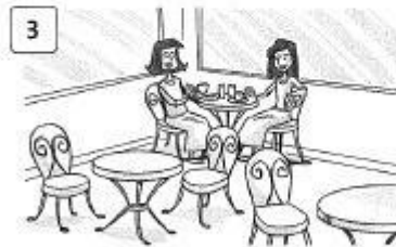
c af é