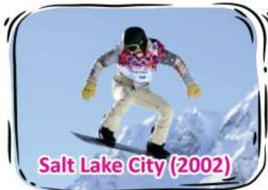
Salt Lake City (2002)