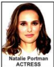
Natalie Portman ACTRESS

an - a - she - her - were - had - in - at - has - luckiest - was - will - luckier