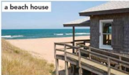
a beach house