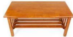
a coffee table