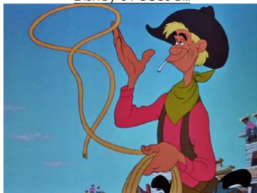
Disney's Pecos Bill