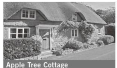
Apple Tree Cottage