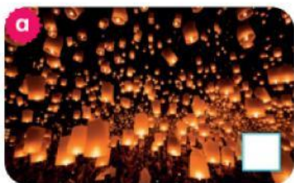
Yi Peng Lantern Festival, Thailand