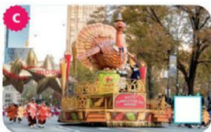
Thanksgiving Day Parade, New York City, United States