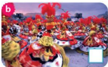
Carnival, Rio de Janeiro, Brazil