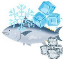
b. cold fish