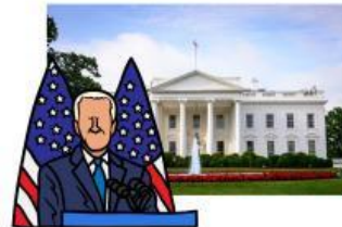
a. White house