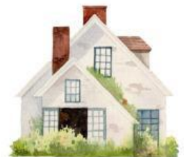
b. white house