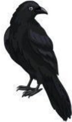
b. black bird