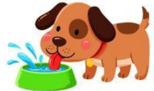
b. hot dog