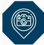
ATTRACTION & ACTIVITIES