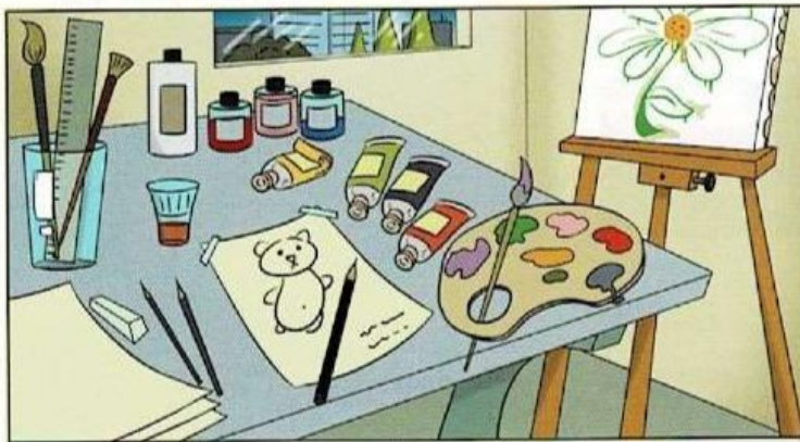
The New Art Class