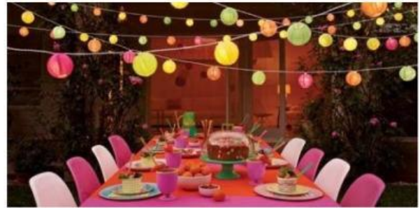
Planning a party