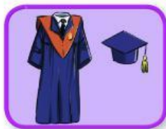
a university education