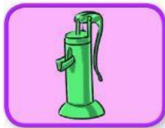
a water pump