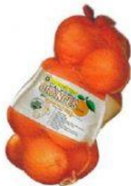
8 pounds of oranges 9.00