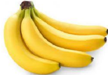
Bunch of Bananas 3.00