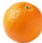
One orange 2.00