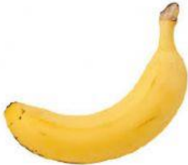
One Banana 1.00