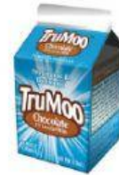
Small carton of chocolate milk 1.00