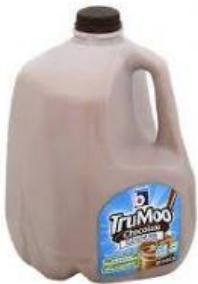
Gallon of chocolate milk 5.00