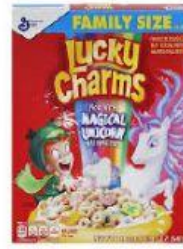
Lucky Charms 5.00