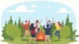
Dance around the campfire