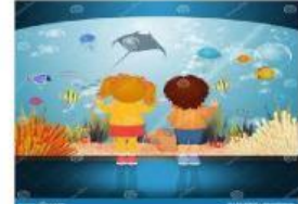
Watch the fish