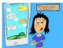
text your friends