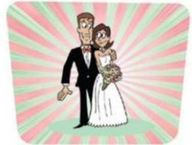
They're married .