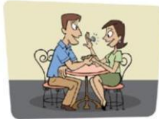
They're engaged . (He's her fiancé . / She's his fiancée .)