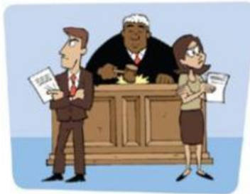
They're divorced . (He's her ex-husband . / She's his ex-wife .)