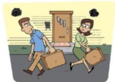
They're separated .