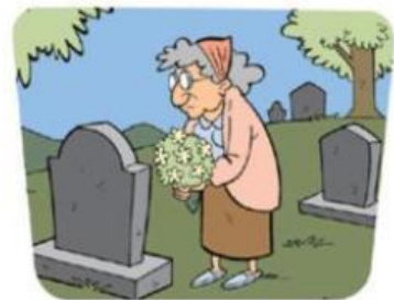
She's widowed .

B LISTEN TO CLASSIFY Listen and infer the marital status of the person in each conversation. Circle the correct status.