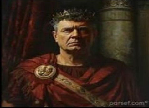
Nero, the Roman Emperor, Is mentioned in the New Testament's Book of Acts