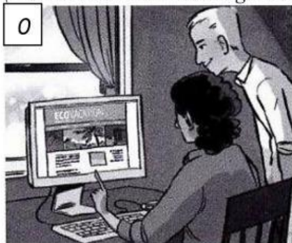
want a holiday

5. _____ you _____ (call) your friend yesterday?