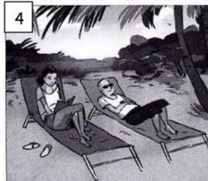
relax on the beach