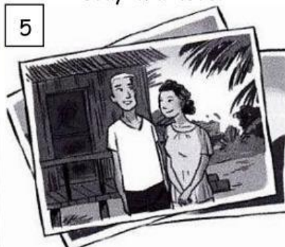
enjoy their holiday