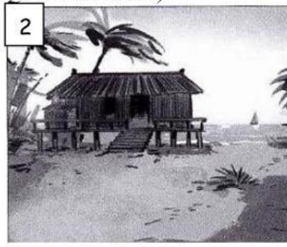
stay in a hotel