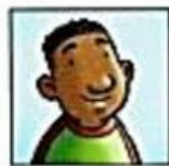
his best friend