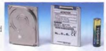
Toshiba's 1.8" hard drive; mini hard drives are used in small gadgets, such as PDAs and wristwatches

The average time required for the read/write heads to move and find data is called seek time (or access time ) and it is measured in milliseconds (ms); most hard drives have a seek time of 7 to 14 ms. Don't confuse this with transfer rate – the average speed required to transmit data from the disk to the CPU, measured in megabytes per second.