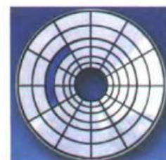
In a defragmented disk, a file is stored in neighbouring sectors