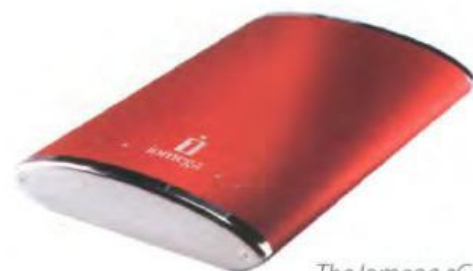
The Iomega eGo portable hard drive.